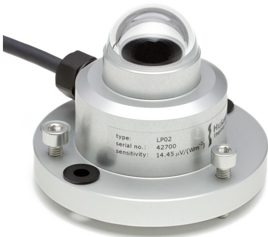
Figure 1 LP02 second class pyranometer

LP02 is a solar radiation sensor that is applied in most common solar radiation observations. It complies with the second class specifications of the ISO 9060 standard and the WMO Guide. LP02 pyranometer is widely used in (agro-)meteorological applications and for PV system performance monitoring.