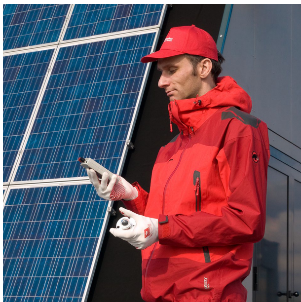
Figure 2 pyranometer in use with LI19 read-out unit